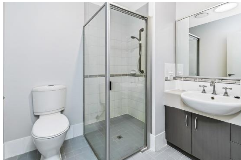
Furniture for display purposes only Maintenance fees: $97.57/wk