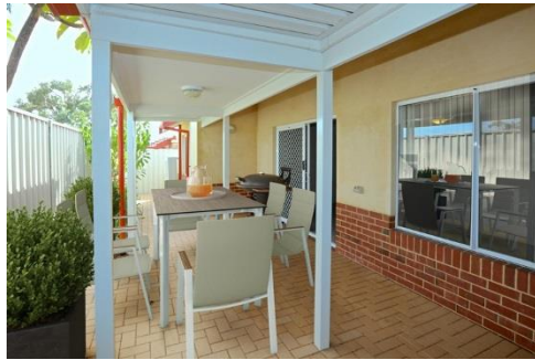
Furniture for display purposes only Maintenance fees: $97.57/wk