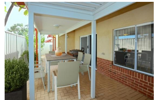
Furniture for display purposes only Maintenance fees: $97.57/wk