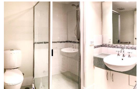
Maintenance fees: $97.57/wk