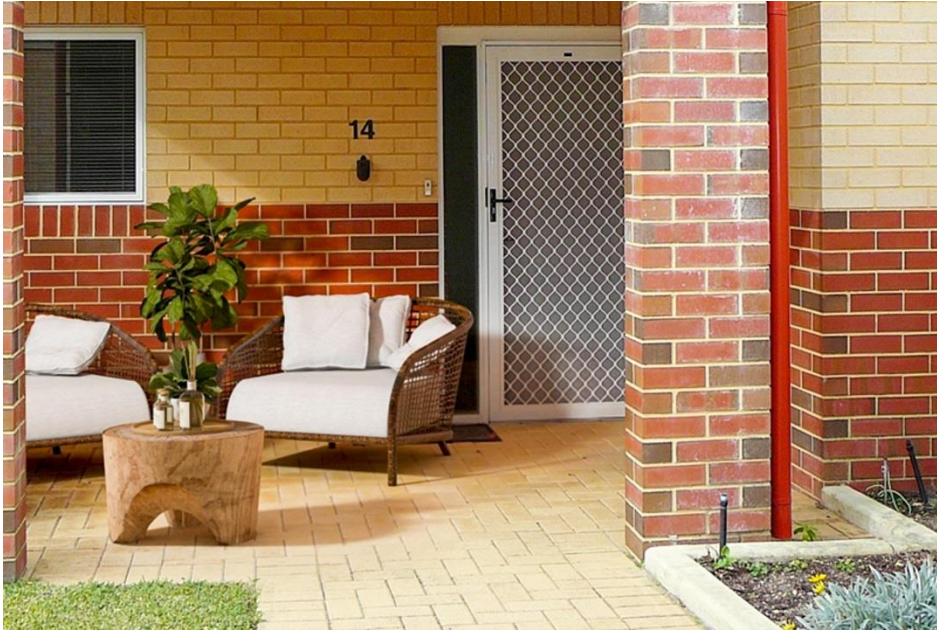
Furniture for display purposes only