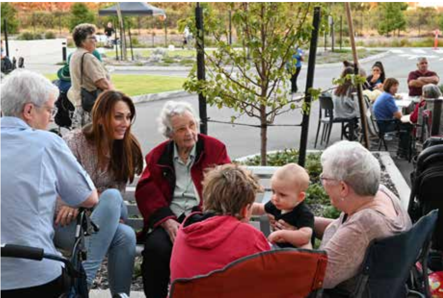
MYVISTA families enjoyed spending time together over food and music