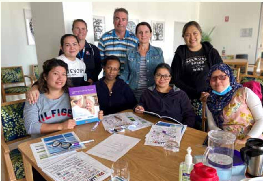
Some of the MYVISTA staff at the workshop to enhance their skills in Advanced Care

"We want everyone who comes into care at MYVISTA to be able to live well and continue to make individual and family memories in the time that is left and for their families to feel supported along the way."